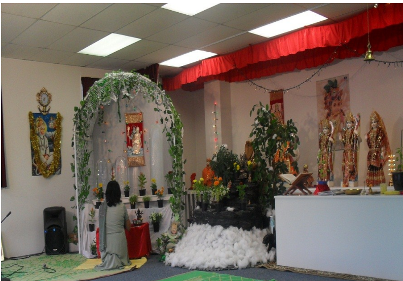
The Decorations on Maha Shivratri at the Hanuman Mandir on 2.3.11. On the left are the “Lings” made of ice. On its right is a depiction of “Kailas Parbat” the home of Lord Shiva.

REMINDER: Please keep the following dates free of any engagements 12 June 2011 Annual Family Fun Day and Girit Celebrations. 25 June 2011 FIA's Annual Dinner Night at the Horticultural Hall, Lower Hutt