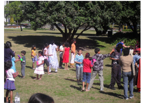
Holi Celebrations: Wellington Hindi School students playing with gulaal.