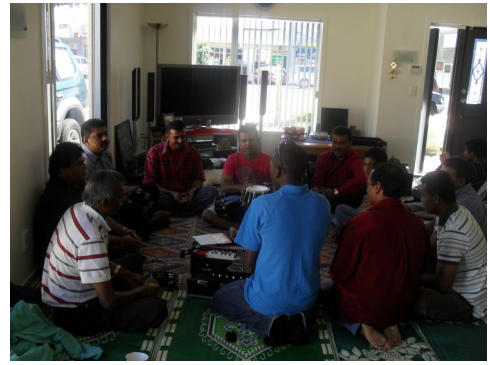
Holi Celebrations: Fiji Indians singing chautal.